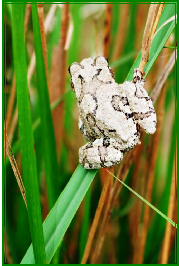
A dorsal view of a Cope's Gray Treefrog resting on a cattail reed.

These two treefrogs also differ in the number of chromosomes: tetraploid in Hyla versicolor and diploid in Hyla chrysoscelis . In addition, the red blood cells of Hyla versicolor are larger than those of Hyla chrysoscelis . Evidently, the two gray treefrog species are genetically incompatible throughout their range. I have heard both species calling from the same breeding pond on several occasions along with several other frog and toad species. Green frogs, leopard frogs, spring peepers, cricket frogs, Fowler's toads and spadefoot toads all share the same breeding ponds.