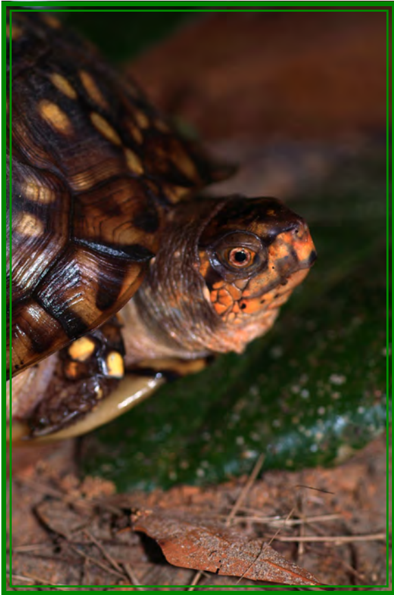
A close-up showing the orange coloration of the head of a female Eastern Box Turtle.

Body measurements are taken upon the initial capture or subsequent recapture of any state-listed species using a squeeze box and cartometer or manipulation along a meter stick. Weight is determined using an Ohaus triple beam balance scale. Sex is determined by probing, counting subcaudal scales, or by noting sexually dimorphic characteristics. The reproductive condition of adult female snakes can be assessed visually or by palpation of the posterior ventral region of the body for bulging eggs.