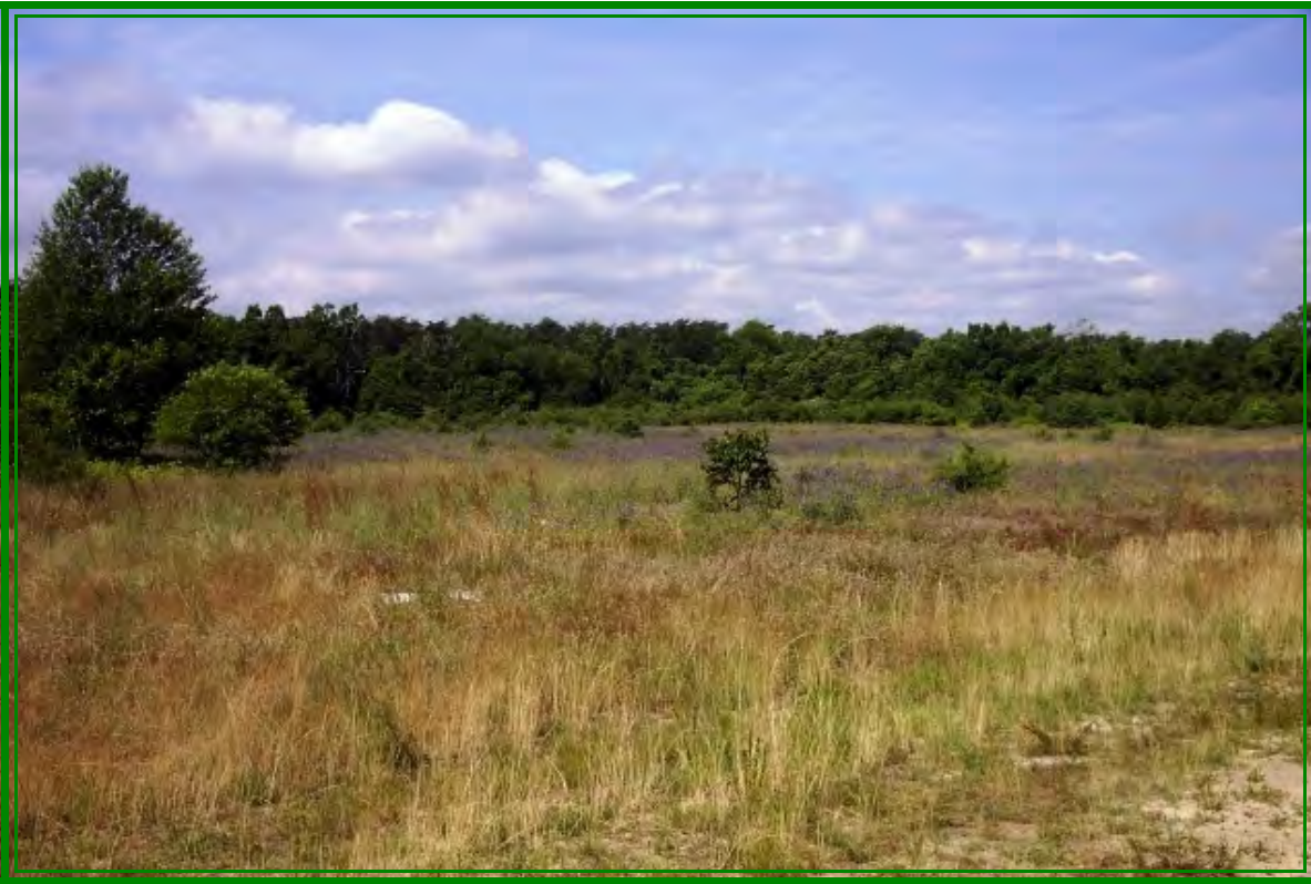
Forest edge or ecotone grassland habitat provides basking and foraging opportunities for many kinds of reptiles and amphibians. Open grassy, sandy fields are often selected by gravid female pine snakes as nesting areas.

The suitability of an area for one or more of the target snake species can be determined by evaluating existing habitat structure. Components that should be considered are: forest type, vegetative types, hydrological conditions, elevation topography, soil type, and surrounding terrestrial habitat are most commonly used to evaluate upland forest as potential habitat for timber rattlesnakes, corn snakes, and/or pine snakes. Typical vegetation in un-developed forest is mainly large pitch pine trees along with various oak species such as scarlet, chestnut, post, white, scrub, and the abundant black-jack oak.