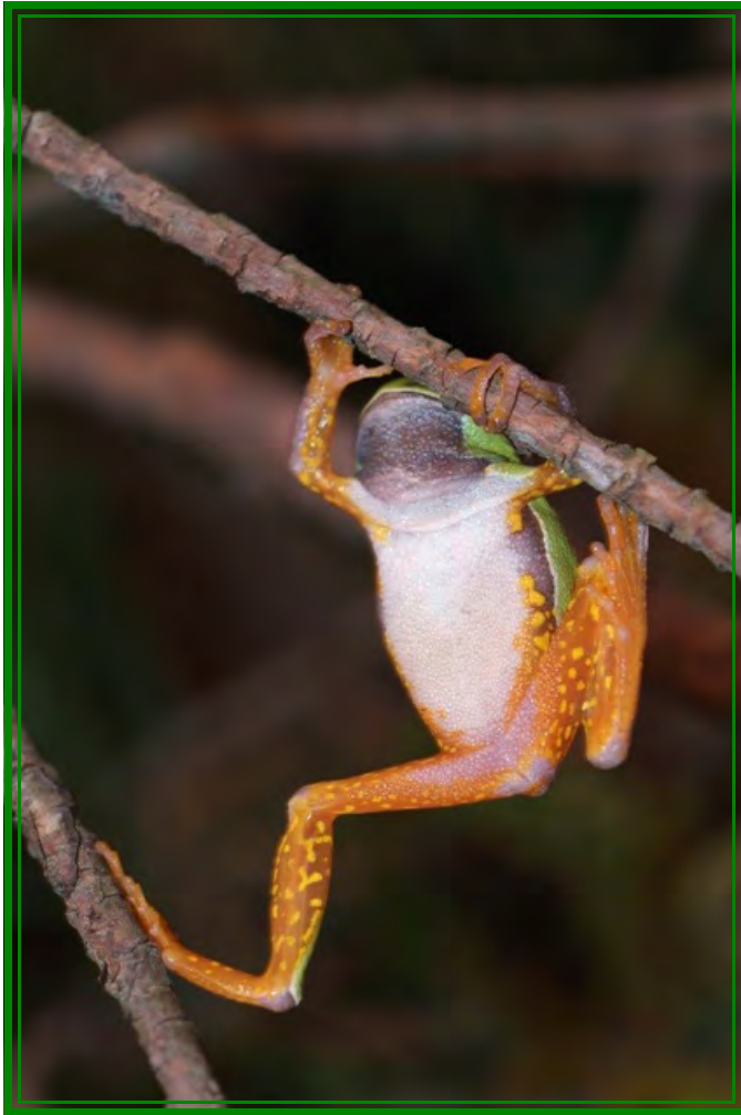
A Pine Barrens Treefrog showing the ventral portion of its body with the bright undersides of the legs. Their sticky toe pads allow them to cling onto the rough bark of shrubs and trees.

If you drive through the New Jersey Pine Barrens with the windows open during warm, wet evenings in spring and early summer, you may hear a strange "quonk-quonk-quonk" sound emanating from wetland ponds. This eerie sound is not the legendary "Jersey Devil," it's mating call of the Pine Barrens treefrog. They select wetland areas such as Sphagnum bogs, hardwood swamps, cranberry irrigation ditches, pitch pine lowland ponds, and wet burrow pits for depositing their eggs. The male treefrogs produce this call, attempting to attract a receptive female to the breeding pond. The calling usually begins in late April or early May and continues sporadically until mid-July. By mid-July, the breeding choruses have tapered off to only a few individuals. Humidity and temperature seem to be important factors in influencing the number of frogs that can be expected to be calling on a particular evening, with frogs preferring evenings when the humidity is high and temperatures above 20.0 C. Rain is another important stimulant which will induce this species to vigorously call for potential mates.