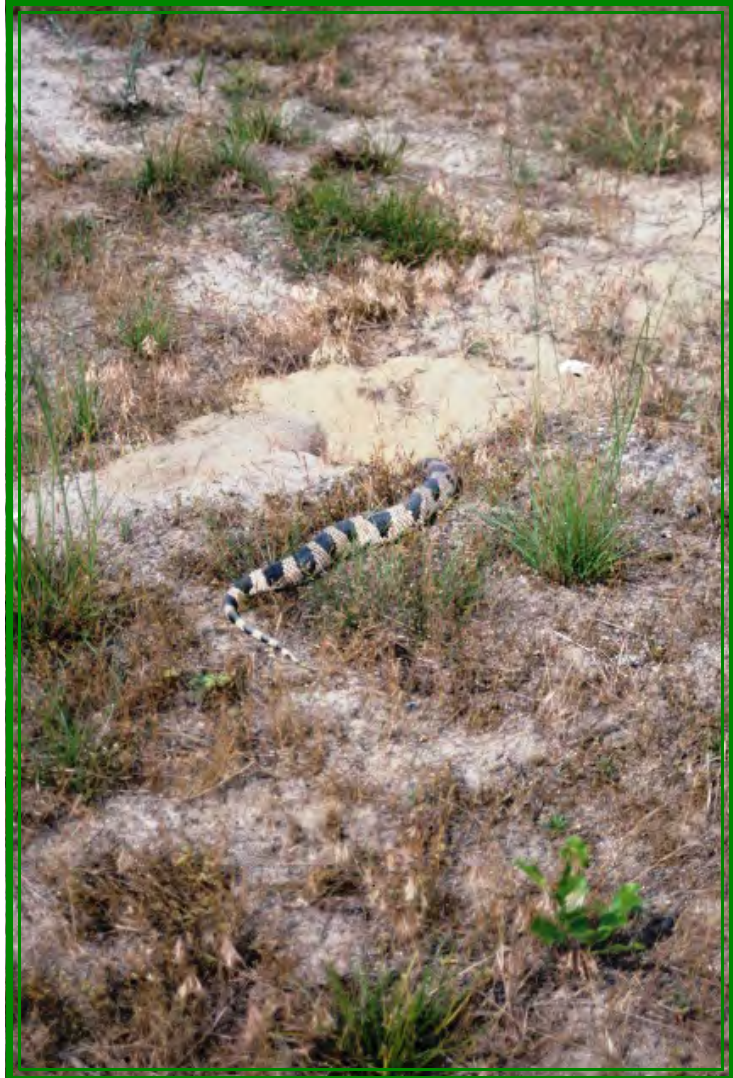
A gravid female Pine Snake excavating her nest tunnel in an open grassy field.