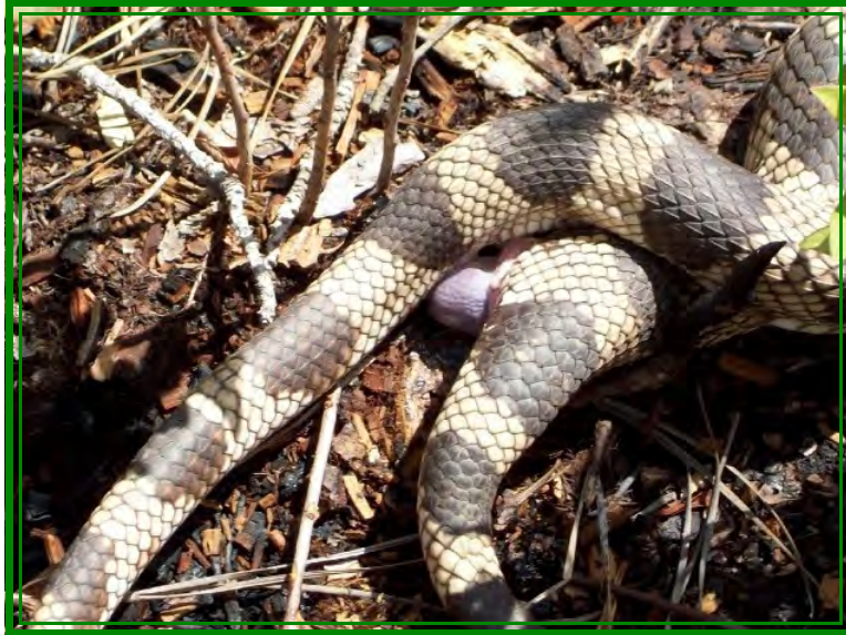
Close-up of copulating Pine Snakes.