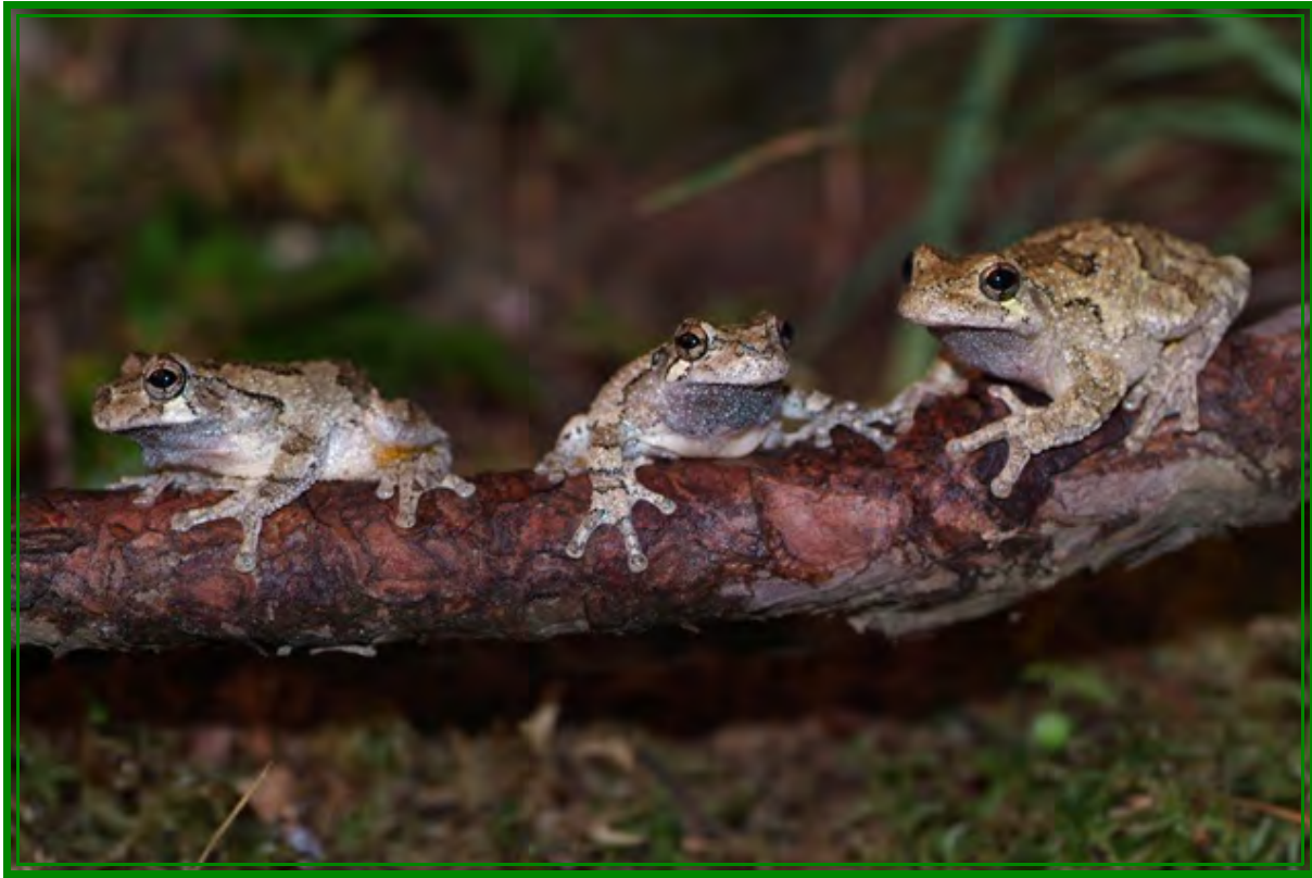
The two specimens on the left are Southern Gray Treefrogs, while the individual on the right is a Northern Gray Treefrog. They can be distinguished by the pitch and rapidity of their vocal call.

In New Jersey, gray treefrogs are normally active between April and October. I have noticed that males start calling when flowering dogwood trees are in bloom. Gray treefrogs breed from early April to mid-June. Males gather and begin calling at breeding sites when night air temperature is above 16 degrees C (60 degrees F). Preferred breeding sites include fishless farm ponds, woodland ponds, vernal ponds, hardwood swamps and human made retention basin or drainage ditches. While calling, vocalizing males may sit at the water's edge or station themselves on a log or branch above the water.