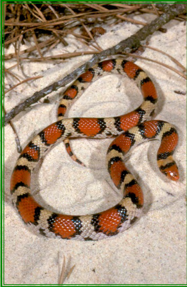
A female Northern Scarlet Snake from Cumberland County, New Jersey. Notice the pointed snout.