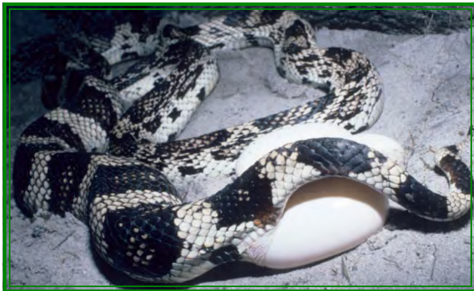
A female Pine Snake laying eggs in her nest chamber.