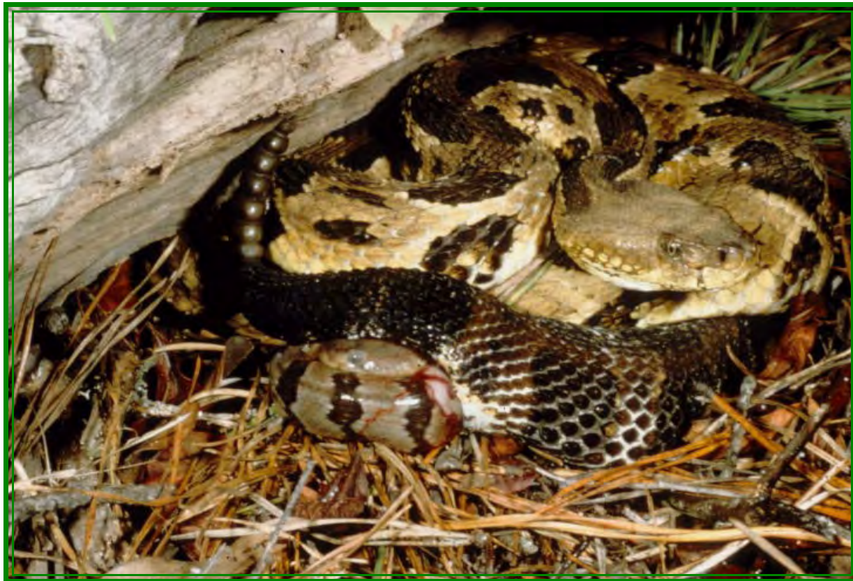
A gravid female Timber Rattlesnake giving birth to a neonate still wrapped in the embryonic sac. The average litter size is 9 snakes for Pine Barrens Timbers. One large female gave birth to 16 neonates.

They are miniature replicas of the adults, but lack the full rattle. Instead they only have the first segment or the button. Each time they shed their skin, they add another segment to their rattle. They shed once or twice before entering hibernation. Neonate rattlesnakes remain with their mother until their first shedding. After a few days, they begin to wander further away from the mother, but remain in her vicinity.