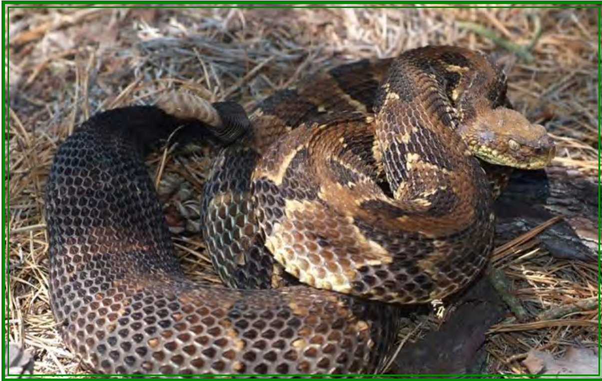
A gravid female Timber Rattlesnake basking on the side of a sand road. This behavior makes them vulnerable to wanton killing by poorly informed people.

Since C. horridus gives birth every 2 - 3 years, non-gravid females use different migratory routes and habitat types than in years when they are gravid. Additionally, their summer activity range in years they are not gravid, may be much greater, due to the need to forage. Radio-tracking studies I conducted with Dr. Howard Reinert showed that gravid females were relatively sedentary using only 15 to 25-acres during the summer, whereas non-gravid females moved farther and used between 75 to 150-acres. Comparison of the movements of gravid versus non-gravid females exhibited a significantly shorter activity-range for gravid rattlesnakes.