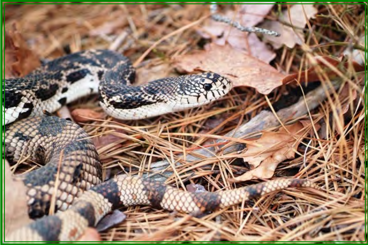
An adult male Northern Pine Snake basking as it was found about four feet from its den entrance.

The range in New Jersey is spotty, with isolated populations restricted to the Pine Barrens; the next nearest historic populations occur in Maryland and north-central Virginia. Other populations are found in eastern North Carolina, South Carolina, Georgia; and west to northern Alabama, western Tennessee and Kentucky. The distribution is spotty over much of their range in eastern United States. The Black Pine Snake is found in portions of Mississippi and Alabama and the Florida Pine Snake occurs throughout most of the state.