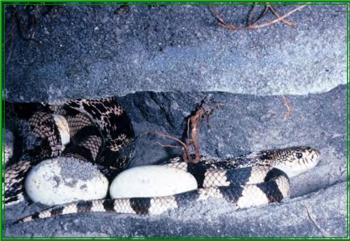
A female Pine Snake resting in her nest chamber while laying eggs.

The average pine snake tunnel and nesting chamber is about one meter (3 feet) in length, but some were measured as long as 7-feet. Many of the nest tunnels curve to either the left or right. Often, it is speculated, that the curve is the result of the snake encountering an obstacle such as a root or a stone, or a broken beer bottle which they must dig around. If not successful, she may abandon the tunnel (known as a test hole), and start another tunnel nearby. The average depth of the nesting chamber from the surface is four to five inches, although some have been found almost a foot or more deep. Another curious feature is that all the tunnels make a downward dip six to twelve inches from the entrance. This low spot may act as a catch basin for water, preventing the nesting chamber from becoming flooded in times of heavy rain.