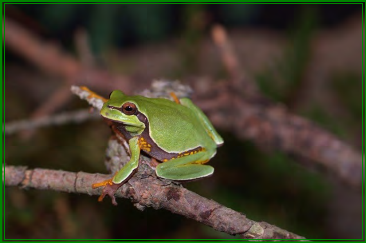
Pine Barrens Treefrogs are known for their rich array of colors. Lavender stripes and orange flash colors on the undersides of their legs.