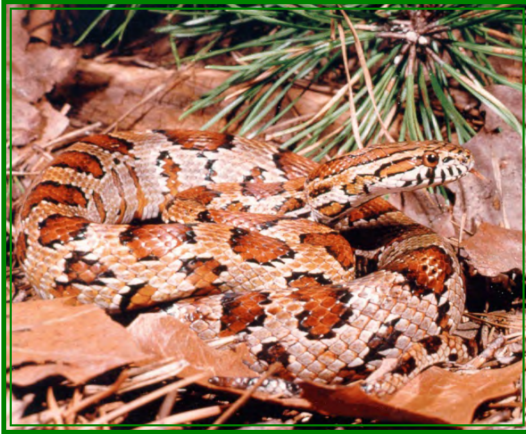
An adult male corn snake basking in oak leaves under a pitch pine tree. This fossorial species spends much of its time under leaf litter, in vole or mole tunnels, or in hollow logs on the forest floor.

Corn snakes may hibernate in communal dens with pine snakes and black racers, or singly in stump hole dens. They appear to have less fidelity to a particular hibernaculum than pine snakes. Emergence from hibernation occurs in late March or early April. Mating occurs in late April and throughout May. Eggs are laid approximately three weeks to one month after copulation, generally in late June or early July.