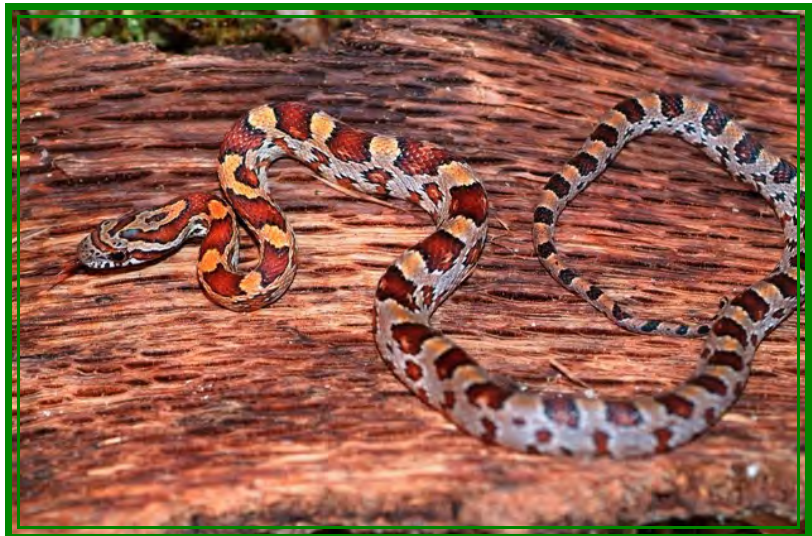
A hatchling Red Rat Snake found crawling next to a fallen pine log and stump hole. Fence Lizards, Ground Skinks and Masked Shrews are in the diet of young Corn Snakes.

Although red rat snakes will hiss, strike and bite when first captured, they will eventually calm down after gentle handling. This is a non-venomous constrictor, feeding primarily on warm-blooded prey including mice, voles, masked shrews, young moles, rats, bird eggs and birds. I once found an adult male corn snake eating quail eggs. Palpation revealed six eggs in its stomach. Juvenile corn snakes also eat frogs, skinks and fence lizards.