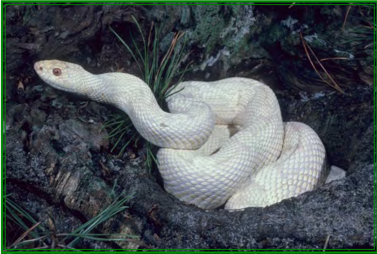
This is a wild albino female Pine Snake caught by the author on August 13, 1986, in Ocean County, New Jersey. The snake lived in captivity until July of 1999, when it died of old age. It is now in the preserve collection at Dr. Joanna Burger's laboratory at Rutgers University.

This behavior may be attributed to decreasing the risk of predation by reducing the amount of time later nesting females spend exposed on the open surface. A second hypothesis for communal nesting is that siblings may nest together, and possibly with their mother. This second hypothesis is supported by the observation that individually marked hatchling female pine snakes imprint on the nesting area from which they hatched, returning to this nesting area after reaching sexual maturity and preparing to lay their own eggs.