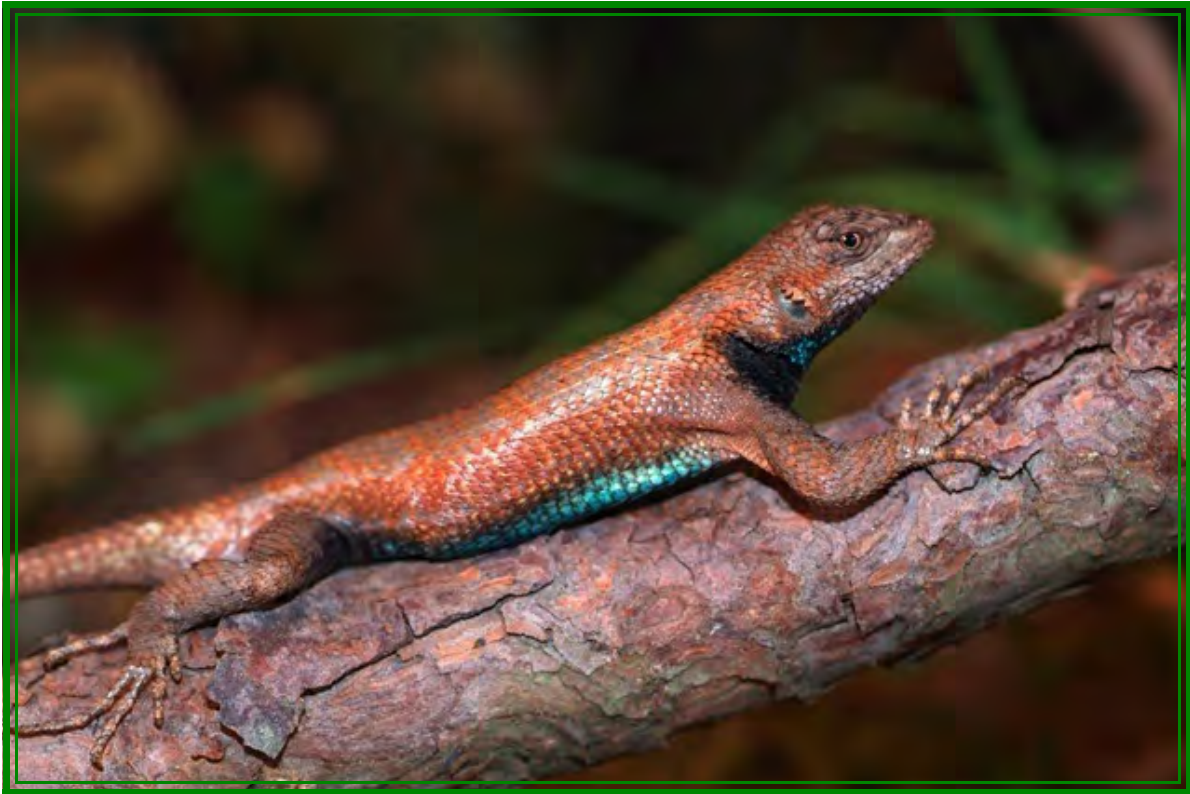
An adult male northern fence lizards ( Sceloporus undulatus hyacinthinus ), basking on a pitch pine branch. Notice the brick colored dorsal scales and the blue and black flash colors on its ventral.

The first reptiles seen were some northern fence lizards ( Sceloporus undulatus hyacinthinus ), that were scurrying up the side of the falling-down wooden shack. Then we flipped some flat plywood boards and found a large black racer ( Coluber constrictor ), that coiled defensively and vibrated its tail at us before disappearing into the tall switch grass. We found a female box turtle ( Terrapene carolina ), with a sunburst orange, yellow and tan shell walking across the path. We admired its beauty for a moment and continued our search of the field and old building foundations and walls, only to find a few more northern fence lizards.