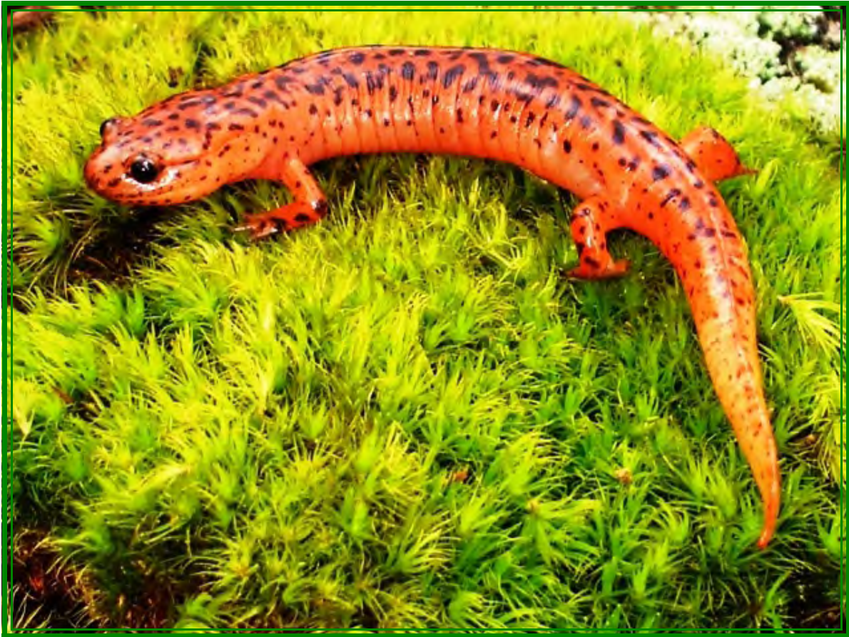
A robust northern red salamander ( Pseudotriton ruber ) that was found hidden under a board. Notice the end of its tail where about two inches are discolored and regenerated.

We walked East on the railroad tracks, all the way to a small bridge over a tea colored stream. A spotted turtle dropped off a fallen log laying in the stream. Along the grassy edge both green frogs and southern leopard frogs hopped into the water and disappeared in the swaying aquatic vegetation. The repeated “quonking” call of a Pine Barrens tree frog could be heard in the distance. White cedar trees grew tall and close along the edge of the stream and the floor of the swamp was covered in a bright green carpet of Sphagnum moss.