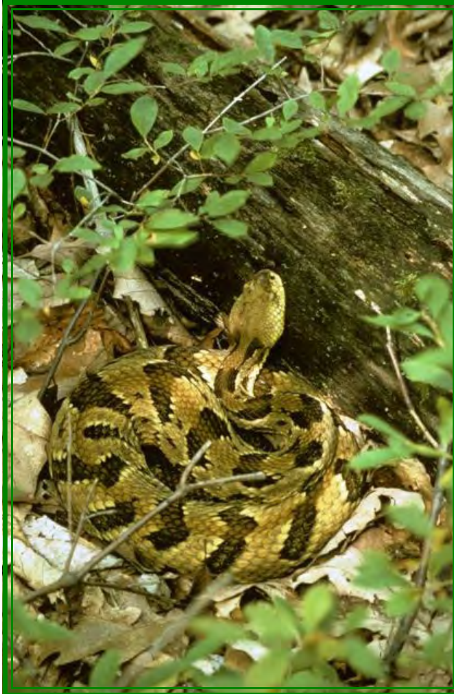
An adult male Timber Rattlesnake in ambush posture. They are sit-and-wait predators and position themselves where rodents will pass. Mice and chipmunks run along the top of fallen logs.

Timber Rattlesnake - In New Jersey there are two geographically separated populations of the Crotalus horridus . The typical Appalachian form occurs in the northern portion of the state, mainly along the Kittatiny Mountain ridge, whereas the isolated Atlantic Coastal Plain rattlesnake population is restricted to portions of Atlantic, Burlington, Camden, Cumberland and Ocean Counties in the Pine Barrens. The focus of this account is on southern New Jersey populations. Because of habitat loss and past human persecution and wanton killing, many timber rattlesnake populations have been extirpated in the Pinelands and throughout the state. Its scientific name horridus refers to its rough body scales and not to a horrible or aggressive disposition as some poorly informed people may think. Some Pinelands residents are quite surprised to learn that rattlesnakes actually occur in southern New Jersey. Although rattlesnakes are venomous, they are not aggressive