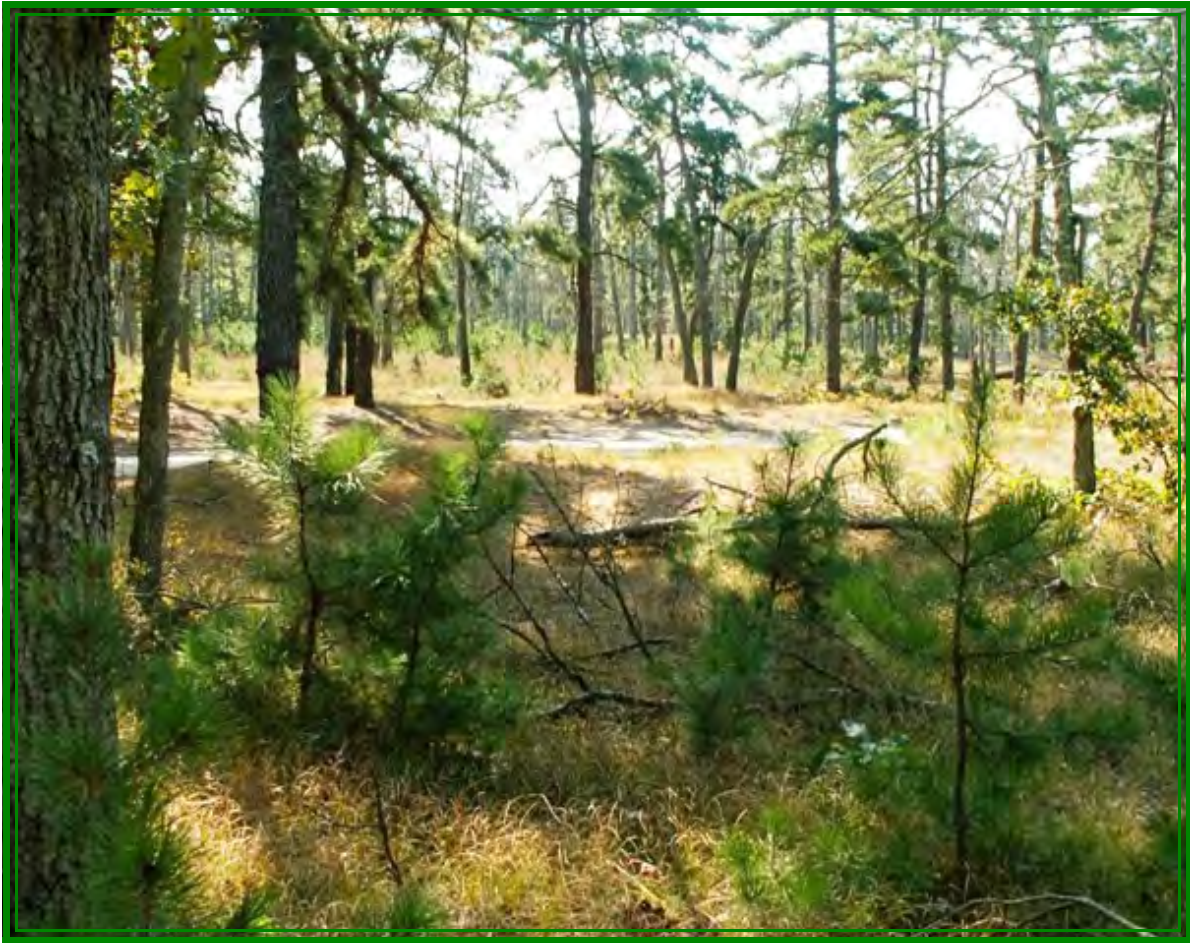
A typical pitch pine dominated forest with switch grass and Pennsylvania sedge grass growing on the forest floor. These open grassy areas support many small mammals and birds.