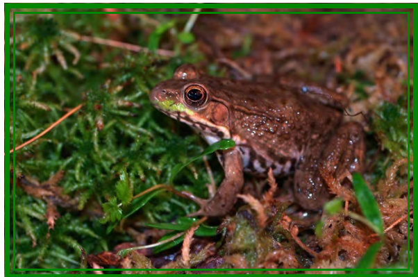
A female Green Frog moving across a Sphagnum bog.