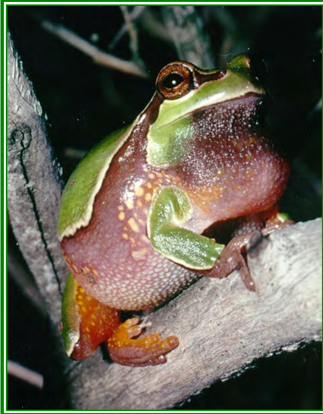
An adult male Pine Barrens treefrog ( Hyla andersonii ) calling while perched on a dead oak branch. During May and June dozens of these frogs can be heard singing for their mates.

Then the egg is released into the water where it will adhere to vegetation or simply rest on the pond bottom. Each spherical egg is surrounded by a jelly-like coating that swells in the water. Depending on the temperature of the water in which the eggs are laid, hatching occurs in 7 to 14 days. The small swimming tadpoles that hatch from these eggs begin to feed on algae, microscopic invertebrates, and tiny bits of plant matter found in their wetland habitat.