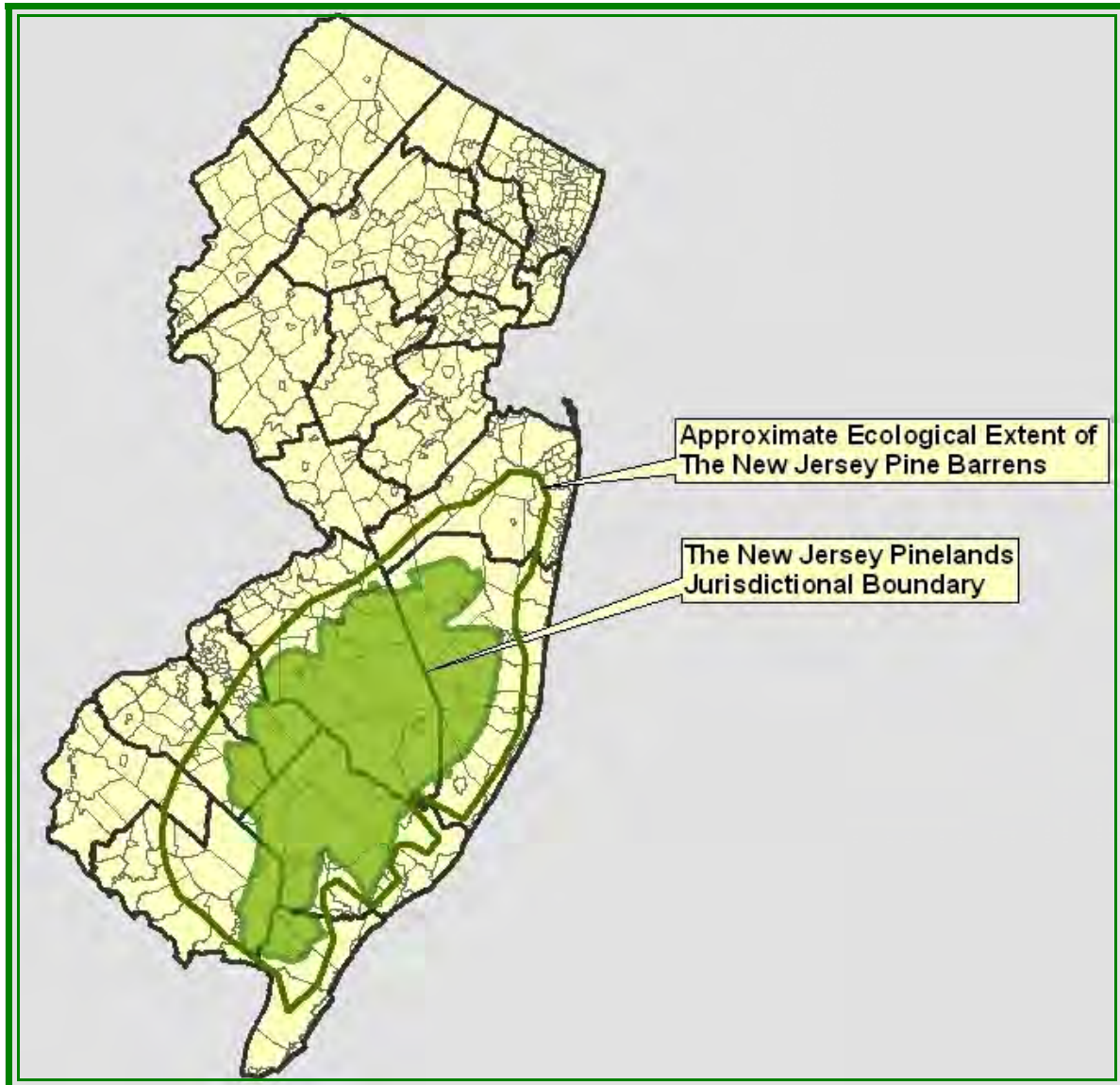
The location of the Pine Barrens in the coastal plain of New Jersey.

Where is the Pine Barrens? Located halfway between such populated areas as New York and Philadelphia, the Pine Barrens of New Jersey encompasses approximately one million acres (445,164 hectares). Even though New Jersey has the highest human population density (436 individuals per km 2 ) in the United States, most of the Pine Barrens has remained a wilderness area that supports many rare forms of plants and wildlife (see location map). Commercial and residential development was a constant threat to the Pinelands back in the 1960 and 1970 eras with a high rate of sprawl.