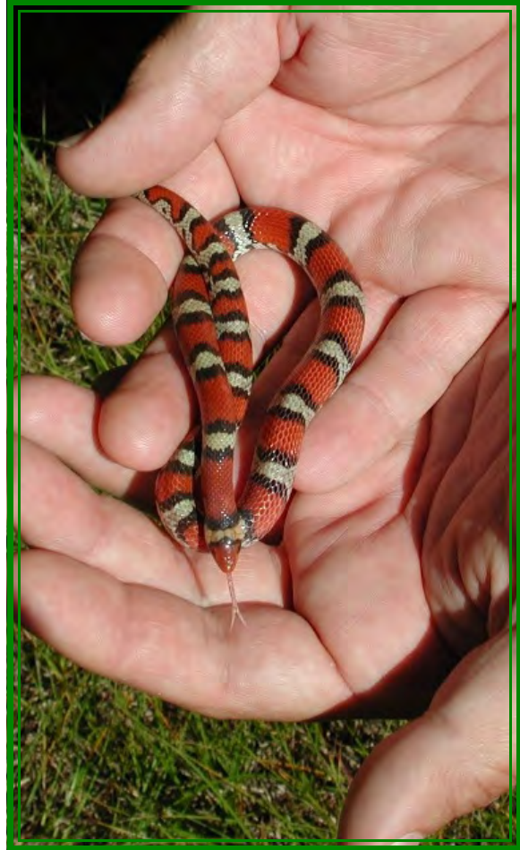
This Scarlet Snake was found concealed under a railroad tie.

The scarlet snake uses a vigorous side to side chewing motion that will eventually pierce the shell of the egg. It then punctures the shell with its pointed snout, thus squeezing out and drinking the contents. A hungry scarlet snake can devour an entire clutch of reptile eggs. I once found a shed skin of a scarlet snake near the entrance of a pine snake nest. After excavating the burrow, the scarlet snake was found under the clutch of pine snake eggs, with its head inside an egg drinking the contents.