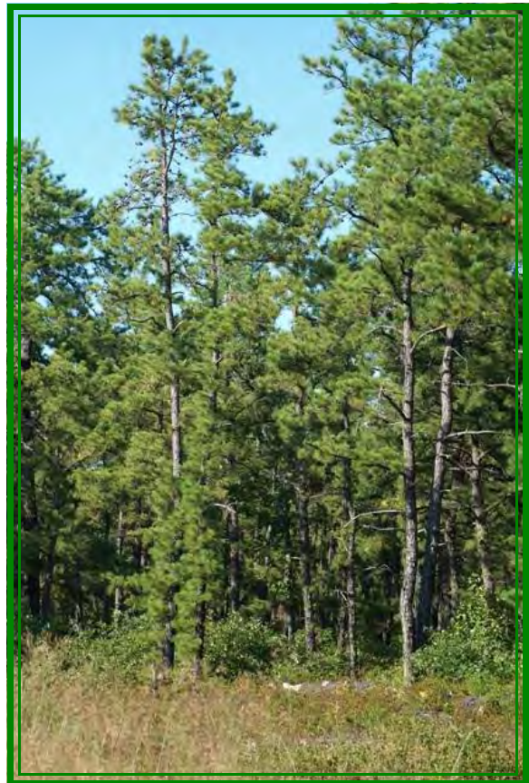
The pine forest edge at Crossley, Ocean County, New Jersey.

We came to a sandy flat section of the road and had trouble driving in soft white sand, but managed to keep going with some extra speed. After traveling about 0.75 of a mile, we came upon an opening in the forest and an abandoned railroad track that ran from East to West through the pine forest. We crossed over the tracks to the North side and could now see an open grassy field to the West. As we approached the field we could see an old shack and the concrete walls and foundations of some old buildings. This was it... the old clay mining town of Crossley. The place that Carl Kauffeld wrote about in his 1957 book, “Snakes and Snake Hunting.” We parked the car in the shade of an enormous sycamore tree, grabbed our home-made snake hooks and began our search for reptiles and amphibians in general and pine and corn snakes in particular. As we walked towards the old ruins the sweet pungent aroma of honey-suckle, sheep-laurel, mountain-laurel and pitch pine filled our nostrils, while a large red-tailed hawk gave it’s territorial cry as it circled in the sky high above us.