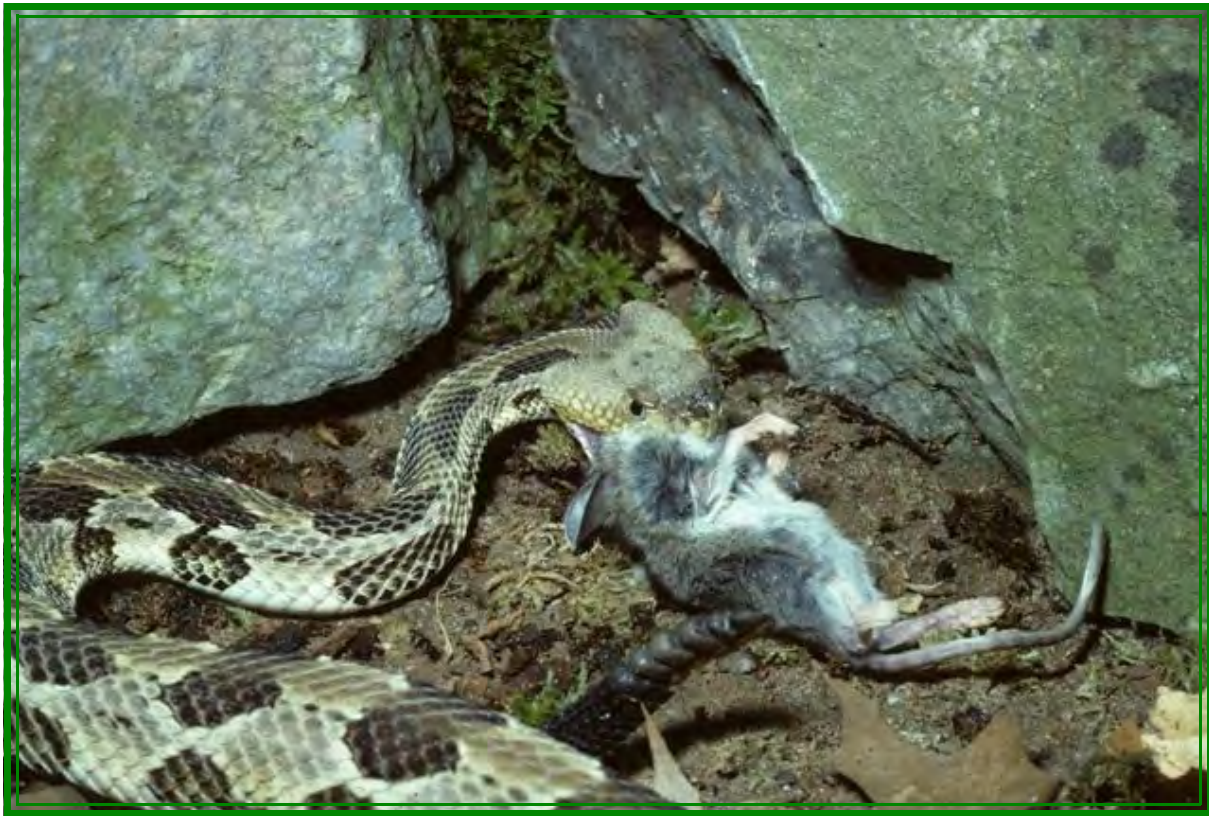
A juvenile Timber Rattlesnake eating a White-footed Mouse it had just killed with its venomous bite.

The following spring, the baby snakes emerge from their hibernaculum beside the stream. They are on their own and venture into the forested upland where they will spend the summer and fall foraging and growing. They grow about 8 to 10 inches a year and reach sexual maturity in 9 or 10 years. During this time they learn about their habitat and where to find prey. They learn migration routes by following scent-trails, set down by the adult rattlesnakes who moved through the forest over generations before them. They use all the suitable Pinelands habitat that is available to them and have been known to travel 3 to 7-miles from their den during the course of their summer active season.