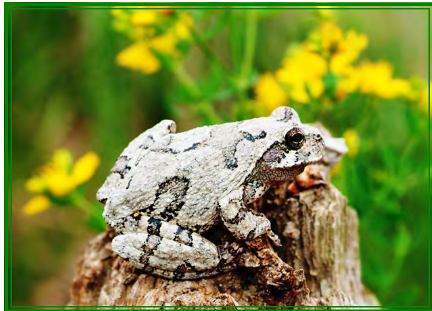
A Southern Gray Treefrog resting on a pine stump.

These look-alike species of treefrogs appear to have the same habits and habitat preferences. Gray treefrogs may be found in small wood lots or high in hollow trees along woodland streams, in large tracks of mixed hardwood forest, and in bottomland forests along rivers and swamps. These frogs can also be observed hiding in nooks and crannies of farm buildings and on porches or decks of homes.