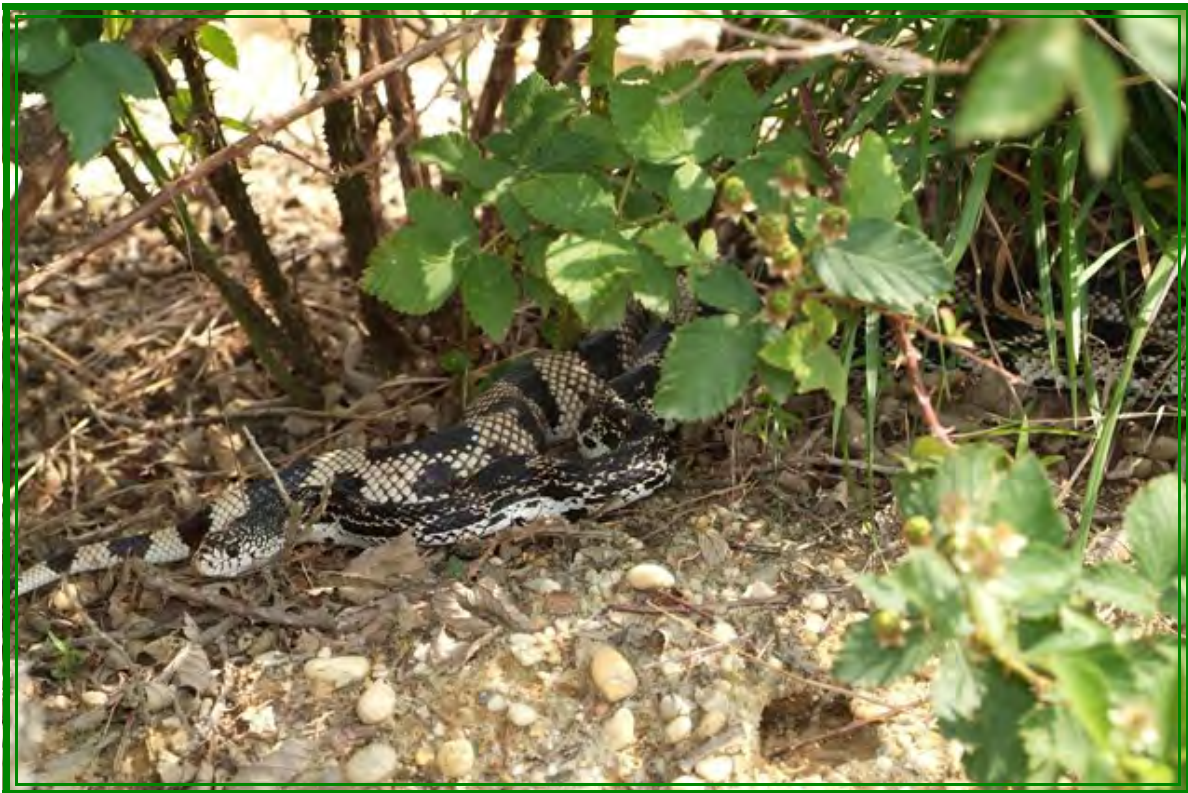
A gravid female northern pine snake ( Pituophis melanoleucus ), basking under a blackberry bush.