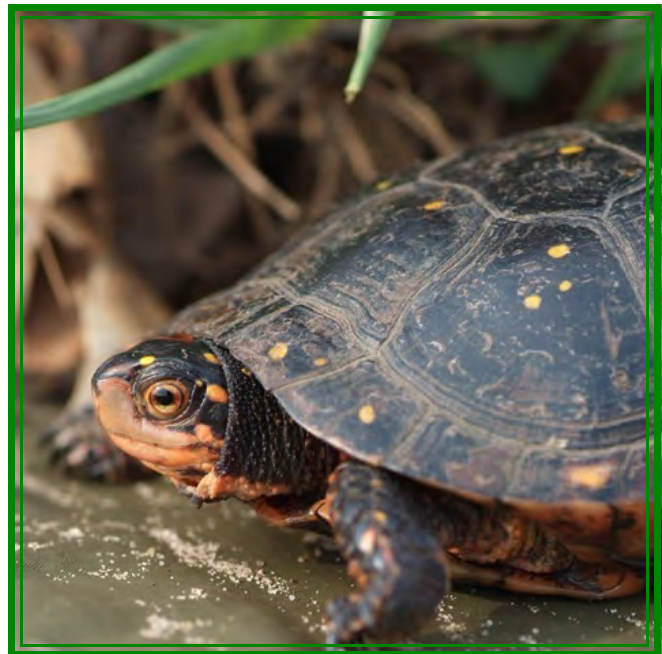
A portrait of a female Spotted Turtle.