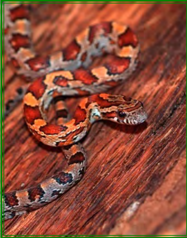
A hatchling Corn Snake from Ocean County, New Jersey. This specimen was found in May 2011, not far from Crossley.

Natural predators include many mammals (e.g., coyote, fox, skunk, weasel, raccoon, opossum and shrews), hawks, owls, and other snakes (primarily eastern king snake and black racer) in New Jersey. Defense is largely restricted to tail vibration, hissing and rapid striking. Despite being very common in some areas of their range (e.g., South Carolina, Georgia and Florida), very little is known of their ecology, seasonal movements, home range size and secretive behavior.