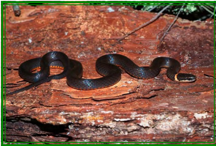
Southern Ring-neck Snakes are a common species in the Pine Barrens.