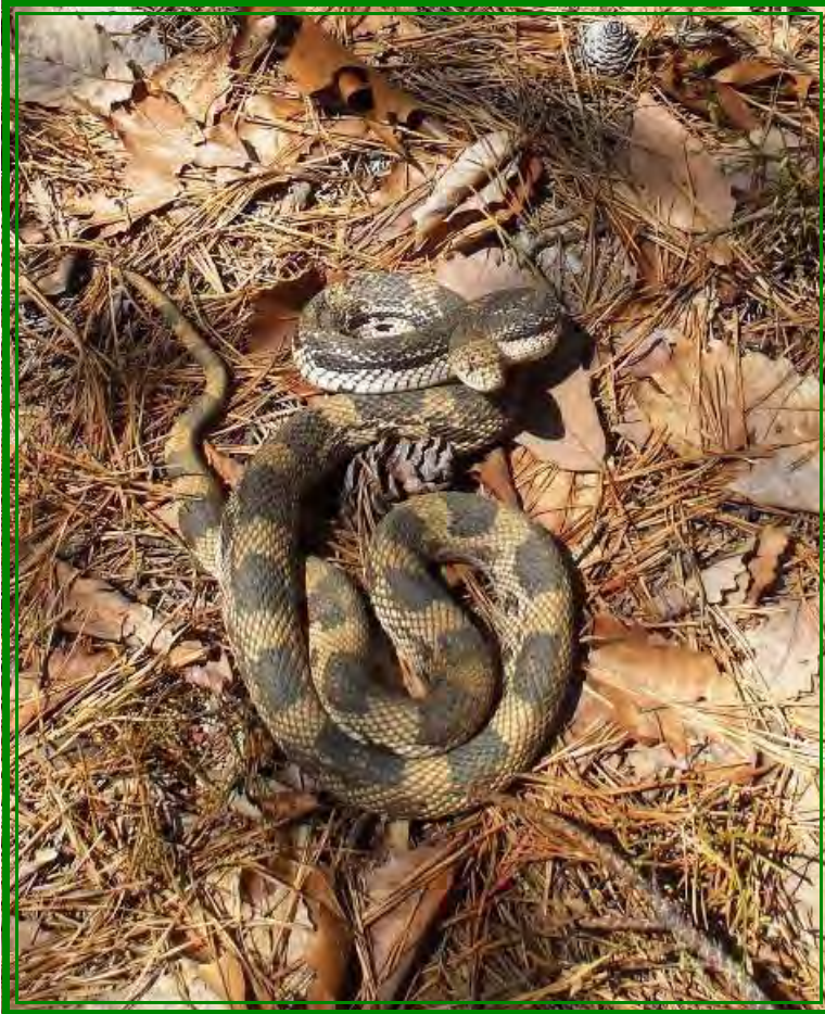
An adult male Pine Snake basking in the morning sun. Pine Snakes are diurnal and are never active after dark. They forage and move about within their home range during the day.

The abandonment of long-term or parental nesting areas may be attributed to a loss of orientation, disturbance of the original nest site, natural succession of vegetation leading to excessive shading of the nesting area, or simple natural pioneering by some females.