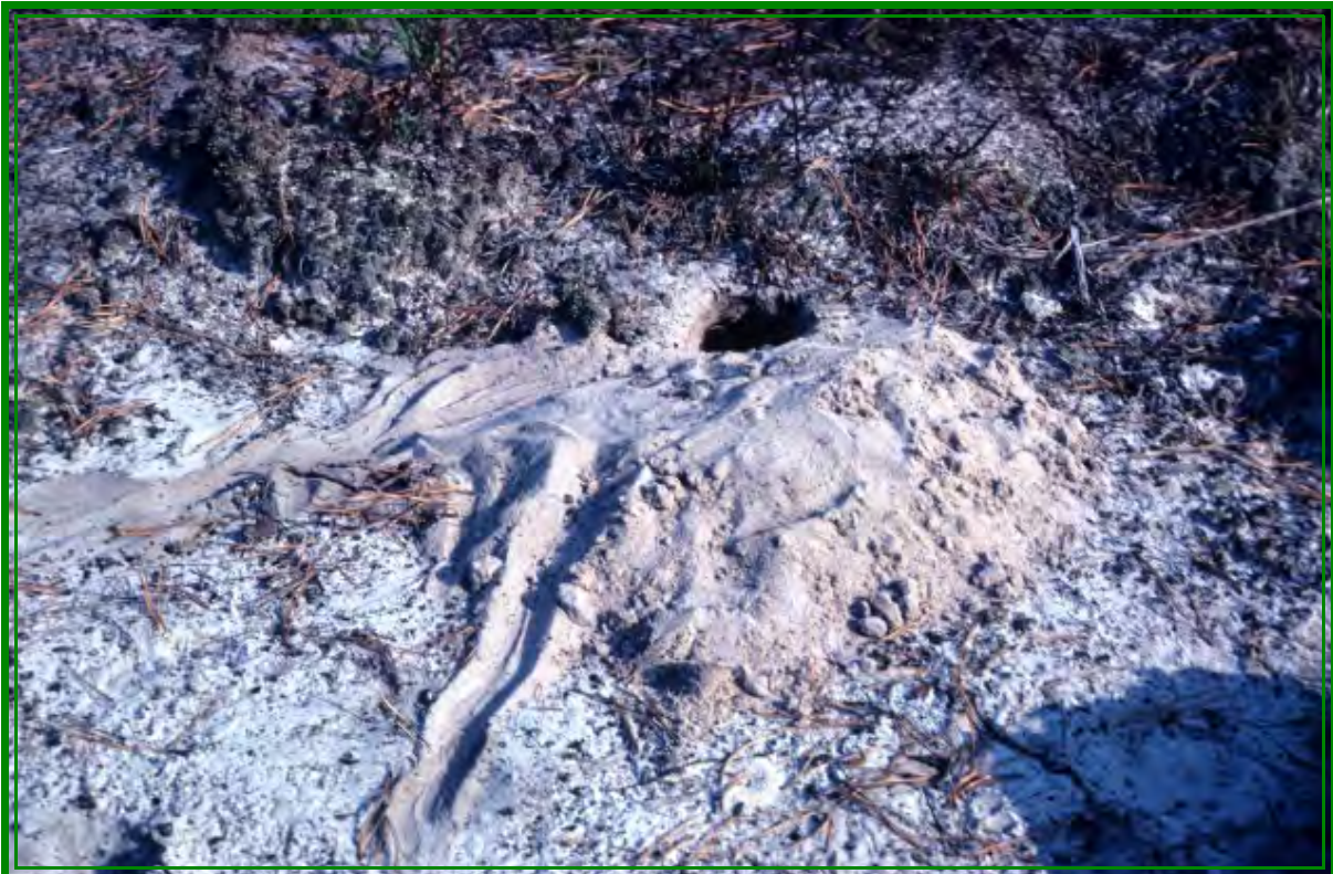
A typical Pine Snake dump pile and sand-fan with the entrance hole in the center. Notice the fresh tracks made by the gravid female while she was digging. Until the tunnel is long enough to accommodate the full body of the snake, they seek shelter under nearby vegetation to avoid the hot sun and predators.