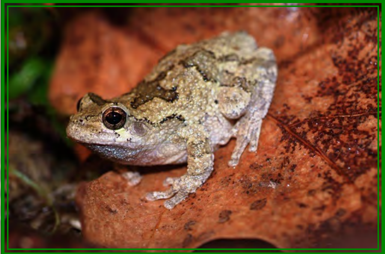
A Northern Gray Treefrog resting on an oak leaf. Morphologically, they look just like the Cope's Gray Treefrog.

Both species of gray treefrogs can be described together due to the extreme similarity of external characteristics. These frogs have warty skin and prominent adhesive pads on the tips of their fingers and toes. Their dorsal color varies from green to light greenish-gray, all gray, brown, or dark brown. Except for very light individuals, a few large, irregular dark blotches are usually present on the back. A large white spot is always present below each eye. The belly is white. The inside of the hind legs is yellow or orange-yellow. Although both species of gray treefrogs found in New Jersey are morphologically identical, the Cope's gray treefrog ( Hyla chrysoscelis ) has a tendency to be slightly smaller in size and is more often green in color than the eastern gray treefrog ( Hyla versicolor ). During the breeding season, females usually appear more heavy bodied, while males leave dark throats. Adult gray treefrogs range in snout vent length from 32 to 51 mm (1 and 1/4 to 2 inches). According to Roger Conant and Joe Collins (1994), the largest specimen recorded is 60 mm (2 and 3/8 inches).