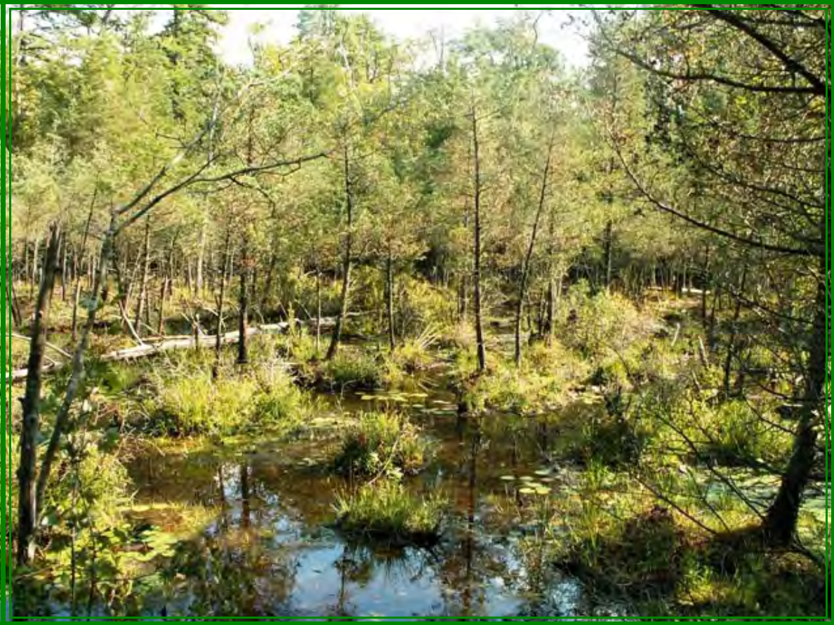
Stream edges and White Cedar swamps are where Timber Rattlesnake and Eastern King Snakes hibernate in the Pine Barrens. The moving water and insulation from roots and moss prevents them from freezing.

The ground surface is often covered with a thick carpet of green and red Sphagnum moss, in densely vegetated white cedar or hardwood stands. The photo below shows a timber rattlesnake entering its winter hibernaculum under a large red maple tree and the drawing illustrates what the underground tunnel looks like based upon personal observations. Gravid female timber rattlesnakes select canopy-free openings that are created by a forest fire, or a human-made edge (an ecotone area), such as a sand road, railroad bed, or transmission line right-of-way, they will remain in these areas until parturition. Natural forest openings are lacking in the Pine Barrens, and thus gravid females often use the edges of sand roads as basking sites. Rookeries are usually 0.3 to 1.0 mile from a winter denning stream. Their summer home-range or primary habitat for C. horridus focuses within a 1.5 to 2.5 mile radius around the den stream. One radio-tracked male had an activity range-length of 7,027 feet (2,142 meters), and a summer home-range of 305.6-acres (123.46 hectares). More recently, between July 31 and September 24, 2010, a large male radio-tracked timber moved 7.1 miles from its summer foraging habitat to its winter den (no paved roads were crossed on its journey). This large movement included the August mating season when males are more active.