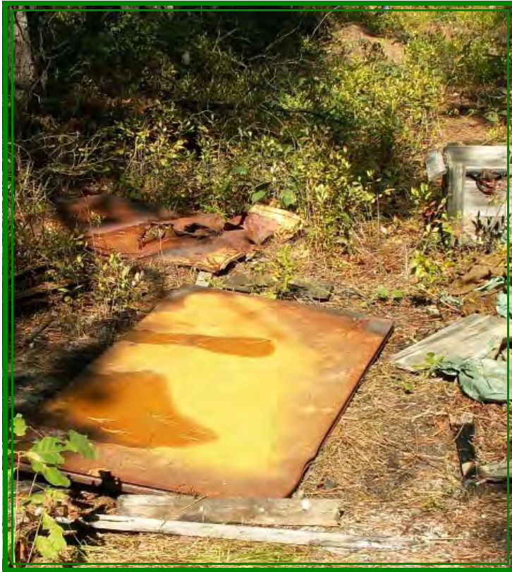
Discarded metal or plywood on the forest floor are good places to look for snakes and other wildlife.

Being able to predict when to search for and find a target species may greatly enhance one's observational and photographic results. Complications affecting capture success include: weather conditions (e.g., temperature and humidity), avoidance behavior by the target species, daily and seasonal activity patterns, and the experience and skill of the person(s) in the field. Unsuitable weather conditions may lead to decreased terrestrial behavior, markedly reduced activity, shifts in habitat type used and/or estivation. I found that repeated random sampling efforts or drift fence trapping programs in suitable habitat over a full activity season resulted in the most accurate species composition and abundance estimates. Random Opportunistic Sampling can be employed while performing other sampling techniques on a study site. This involves searching various areas that have potential habitat for a species of interest. Locations on-