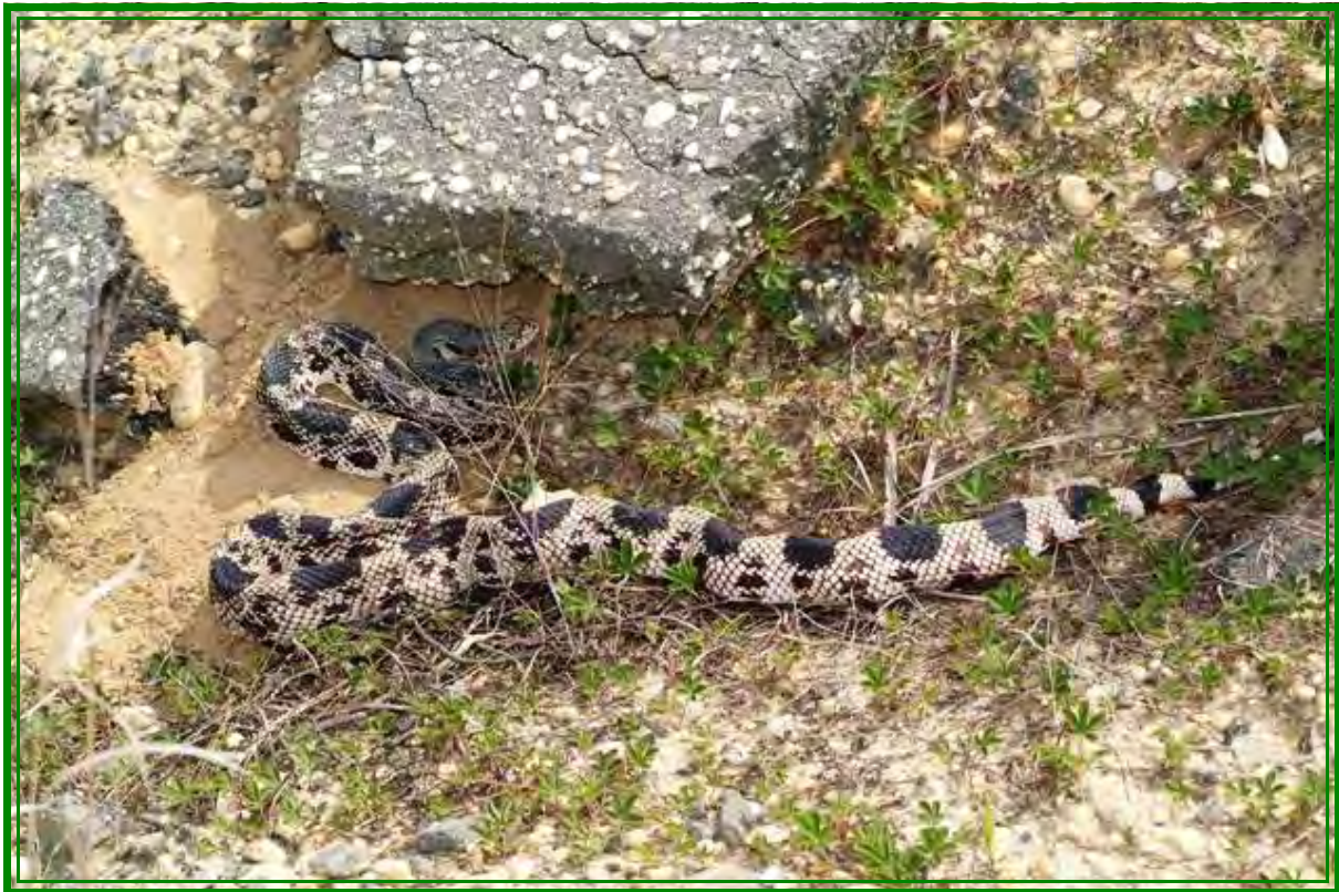
A gravid female Pine Snake searching for her annual nest site.