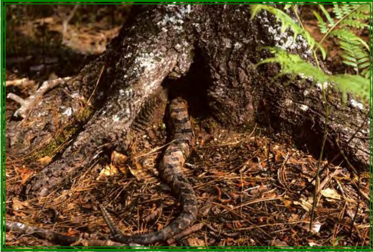
A radio-tracked adult male Timber Rattlesnake entering its winter hibernaculum under a large Red Maple tree along the edge of a Pine Barrens stream. The underground root systems of White Cedar and Black Gum trees are also used by the Rattlesnakes as entrances to get below the frost line.

Timber rattlesnake's typical habitat is pine-oak upland forest which is dominated by pitch pine and mixed with various oaks (post, scarlet, blackjack, scrub, white and chestnut oaks). These upland forests often have intermittent stream corridors, Sphagnum bogs, or grassy savannahs interspersed within them. Pitch-pine lowland forest surrounding the overwintering stream or in adjacent wetlands is also used. The vegetation in these transition areas between upland and wetland is dominated by pitch pine and red maple, with an understory of highbush blueberry, dangleberry, sheep laurel, sweet pepperbush, and other shrubs. Much of the Pine Barrens contains relatively uniform pine-oak forest habitat, thus suitable brooding or rookery areas occur in low frequency.