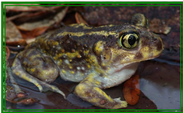
An Eastern Spadefoot Toad at the edge of its breeding pool.