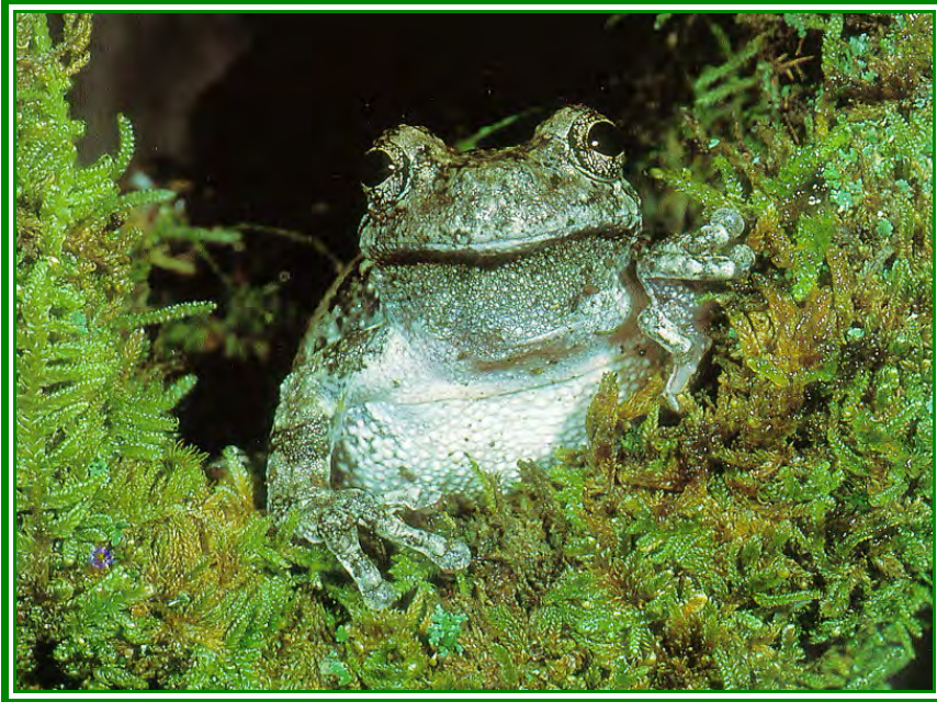
An adult male southern gray treefrog ( Hyla chrysoscelis ) emerging from a moss-covered hollow log. Males have dark throats whereas females have white throats.

Hatching takes place in about 4 or 5 days. Gray treefrog tadpoles have a wide tail membrane which may be red or orange, and bordered with black blotches. The tadpoles transform into froglets in about two months. The newly transformed gray treefrogs average 13 mm (½ inch) in length and are usually green with the identifying white spot beneath their eyes. They spend most of the remainder of the summer in low vegetation near the breeding pond or in the surrounding forest. Calls of the two gray treefrogs species are very different and described